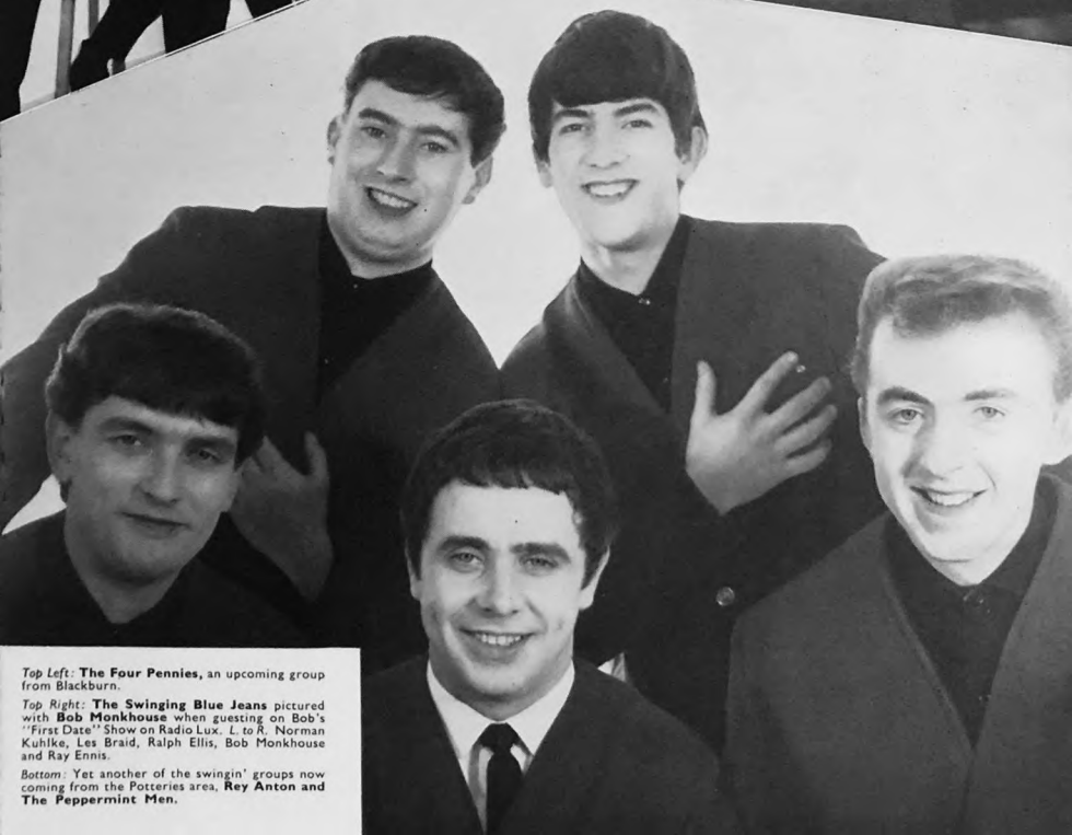
Top Left: The Four Pennies , an upcoming group from Blackburn.